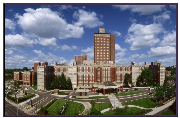
Henry Ford Hospital - Detroit, MI - U.S.A.

This program will provide these residents with a unique experience focused on Gynecologic Oncology, Urogynecology, and Maternal Fetal Medicine. Continued on page 3